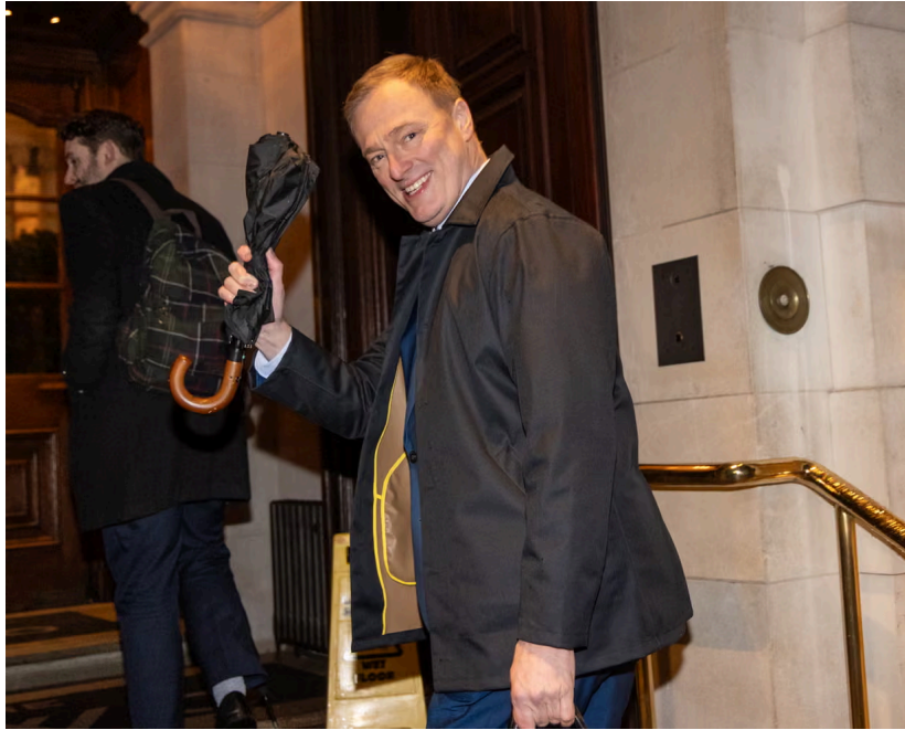
📷 The GB News presenter and former Brexit party MEP Martin Daubney arrives at Raffles hotel for the book launch. Nigel Farage was among the guests.